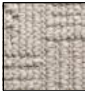
Low Pile Carpeting