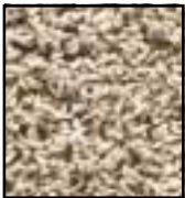
High Pile Carpeting

For homes with extensive use of wall to wall carpeting, a premium air turbine kit is an alternative to an electric kit. Designed for both high-pile padded carpet and carpet laid directly on hard floors, the turbo brush provides great cleaning. With the additional tools, this kit is also suited for hard floor surfaces such as tile and wood, as well as above-the-floor cleaning.