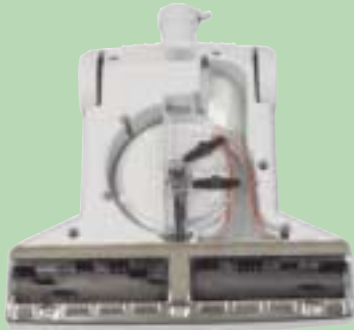
— A full 14" cleaning width —