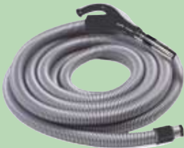
Lightweight hose with excellent airflow.