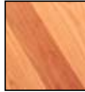
Hard Floor Surfaces