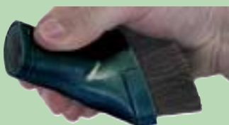
Molded in vinyl for a soft touch to protect fine furnishings.