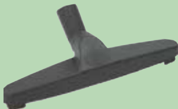
Notched in front to prevent bull-dosing of dirt.