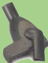
The Stairclimber Air Turbine's fold-out crevice tool folds out when needed and easily folds in when not needed.