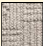
Low Pile Carpeting