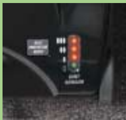
Dirt Sensor...Lets you know when the carpet area is clean.