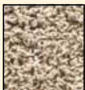
High Pile Carpeting

For homes with a variety of carpeted surfaces and numerous other areas to clean, such as above the floor cleaning, shelves, furnishings, and hard floor surfaces, the 3 in 1 kit is perfect. It includes tools for almost every cleaning application.