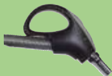
The tear drop design reduces in-hand weight and promotes longer hose life.