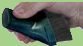
Molded in vinyl for a soft touch to protect fine furnishings.