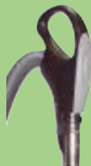
Cord management makes above the floor use easy and convenient.