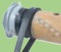
Quiet Drive...V-Technology for continuous contact between brush and belt.