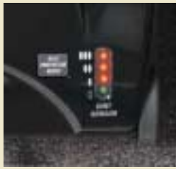
Dirt Sensor...Lets you know when the carpet area is clean