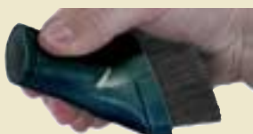
Molded in vinyl for a soft touch to protect fine furnishings.