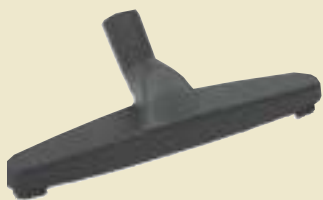
Notched in front to prevent bull-dosing of dirt.