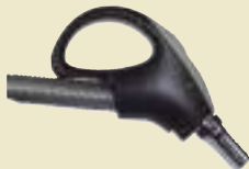
The tear drop design reduces in-hand weight and promotes longer hose life.