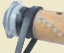
Quiet Drive...V-Technology for continuous contact between brush and belt